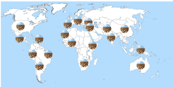
Fig. 2. Case studies on assessing Drought Early Warning Systems in different parts of the world presented at the ISIDIS, Casablanca, Morocco, November 2011.

In the USA, the Federal Government's National Integrated Drought Information System (NIDIS) and the University of Nebraska-based National Drought Mitigation Center (NDMC) jointly support or conduct impacts assessment, forecast improvements, indicators and management triggers and the development of watershed scale information portals (web-based). In partnership with other agencies, tribes and states, the NIDIS teams coordinate and develop capacity to prototype and then implement regional drought early warning information systems using the information portals and other sources of local drought knowledge. The U.S. Drought Monitor, an innovative partnership among academia and Federal agencies (Svoboda et al., 2002), provides information on the current conditions of drought at the national and state level through an interactive map available on the website accompanied by a narrative on current drought impacts and a brief description of forecasts for the following week. It has a unique approach that integrates multiple drought indicators with