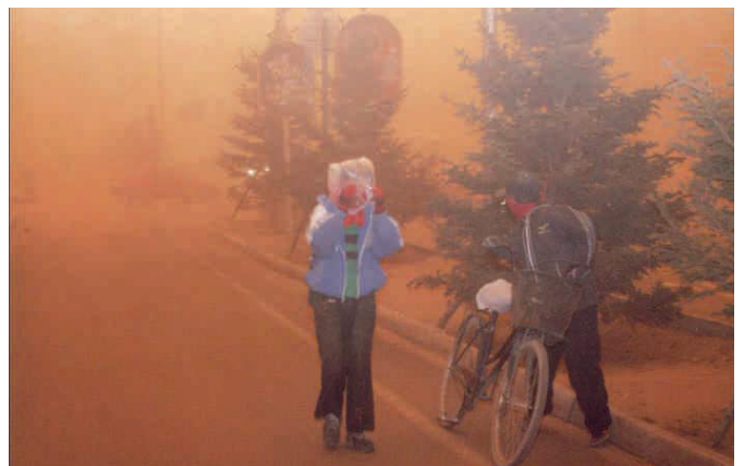
Desertification processes can lead to the formation of large dust clouds that affect air quality and cause health problems thousands of kilometres away (Xinlinhot, China)

Desertification has environmental impacts that go beyond the areas directly affected. For instance, loss of vegetation can increase the formation of large dust clouds that can cause health problems in more densely populated areas, thousands of kilometers away. Moreover, the social and political impacts of desertification also reach non-dryland areas. For example, human migrations from drylands to cities and other countries can harm political and economic stability.