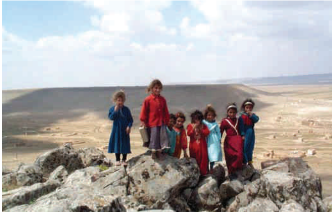
Desertification affects the world's most vulnerable populations.

Desertification is the persistent degradation of dryland ecosystems by variations in climate and human activities. Home to a third of the human population in 2000, drylands occupy nearly half of Earth's land area. Across the world, desertification affects the livelihoods of millions of people who rely on the benefits that dryland ecosystems can provide.