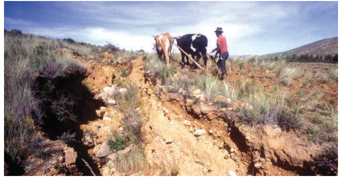
Serious erosion is threatening a farmer's land

Historically, dryland livelihoods have been based on a mixture of hunting, gathering, farming, and herding. This mixture varied with time, place, and culture, since the harsh conditions forced people to be flexible in land