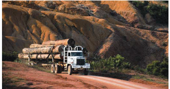
Unsustainable use of resources can contribute to land-degradation.

The creation of a “culture of prevention” that promotes alternative livelihoods and conservation strategies can go a long way toward protecting drylands both when desertification is just beginning and when it is ongoing. It requires a change in governments’ and peoples’ attitudes. Building on long-term experience and active innovation, dryland populations can prevent desertification by improving agricultural and grazing practices in a sustainable way.