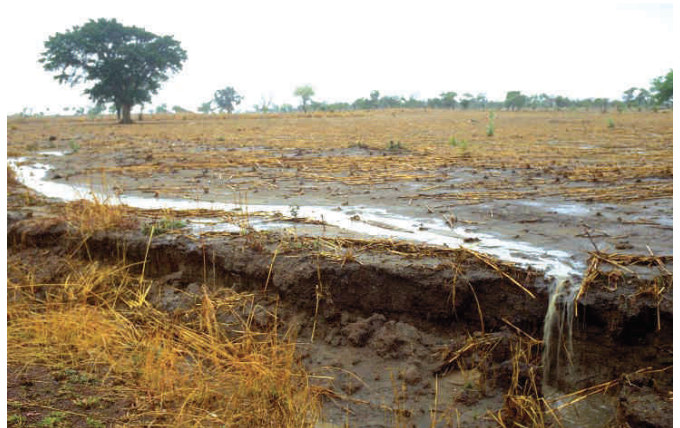
Water-erosion and reduced soil conservation negatively affects ecosystem services

Environmental management approaches for combating desertification, conserving biodiversity, and mitigating climate change are linked in many ways, thus a joint implementation of the U.N. Conventions to Combat Desertification, on Biological Diversity, and on Climate Change can yield multiple benefits.