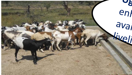
Uganda 2: Karamoja enhancing water availability for livelihoods