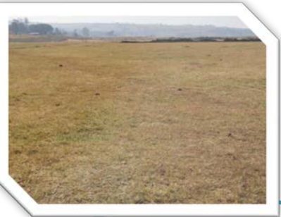
Ethiopia: Participatory restoration of Lake Haramaya