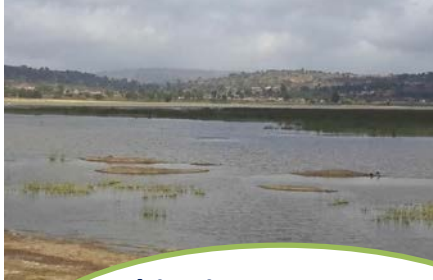
Ethiopia 2: Water allocation in Awash River Basin during drought