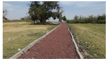
Ethiopia 3: Water Management in Lake Ziway Watershed- constructed walkway as buffer